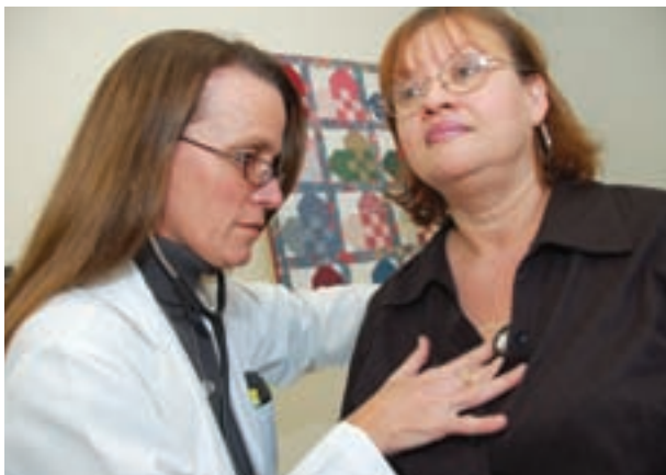
AmeriCares staff photo